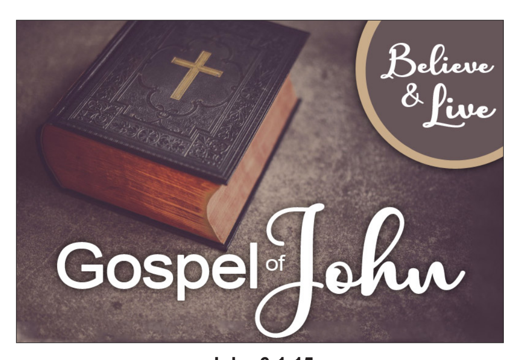
John 6:1-15 The Power of God